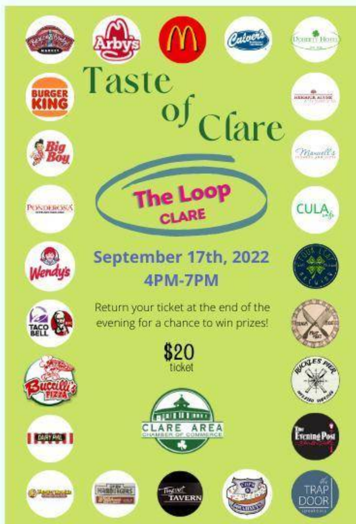
(Last Years Ticket)

For more information call 989.386.2442 events@claremichigan.com